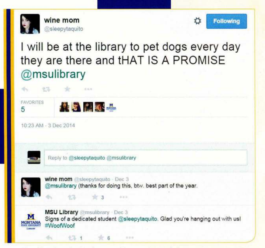
Interacting with undergraduate student around the event Paws to de-Stress event

Social Media Group (lib.montana.edu/ about/social-media). This small committee—comprising three librarians and a library staff member-was tasked with providing direction, structure, and purpose for the library's social media activity. This programmatic initiative allowed us to produce a focused outreach and community-building strategy for our library social media. To document our strategy and goals, we created a Social Media Guide (lib.montana.edu/ about/social-media/#guide). We used it to direct our efforts and also to communicate our work to others within our organization and campus community. In short, creating and following our Social Media Guide allowed our social media to flourish. As one of our committee members is fond of saying, "Make a plan, work the plan."